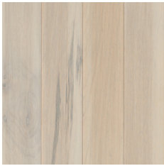
Mystic Taupe 5" ● APM5401 3-1/4" ● APM3401