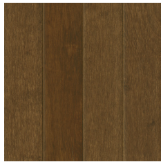
Americano 5" ● APM5404 3-1/4" ● APM3404