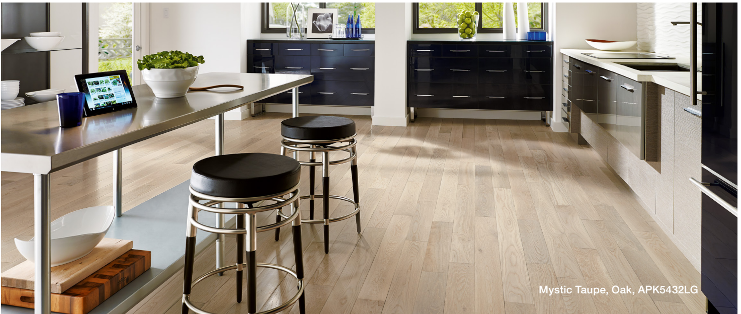
Mystic Taupe, Oak, APK5432LG

Blackened Brown 5" ● APK5475LG 5" ● APK5275 3-1/4" ● APK3475LG 3-1/4" ● APK3275 2-1/4" ● APK2475LG