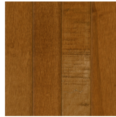
Spice Brown 5" ● APM5403 3-1/4" ● APM3403