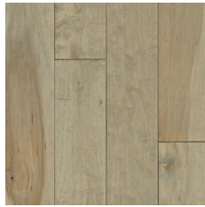
Mesa Taupe 5" ● APM5411LG 3-1/4" ● APM3411LG