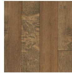
Aged Bourbon 5" ● APM5412LG 3-1/4" ● APM3412LG