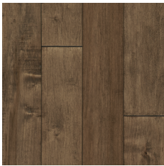
Rich Sable 5" ● APM5413LG 3-1/4" ● APM3413LG