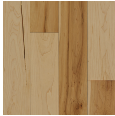
Natural 5" ● APM5410LG ● APM5400 3-1/4" ● APM3410LG ● APM3400