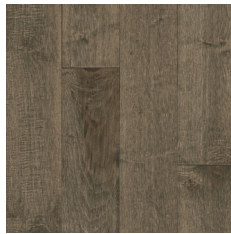
Chateau Gray 5" ● APM5414LG 3-1/4" ● APM3414LG