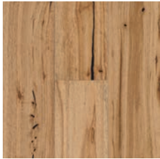
Natural 6-1/2" EKNR63L27W