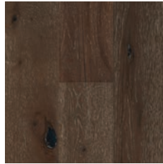
Dark Brown 6-1/2" EKNR63L17W