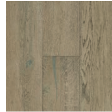
Mountain Wilderness 6-1/2" EKNR63L47W