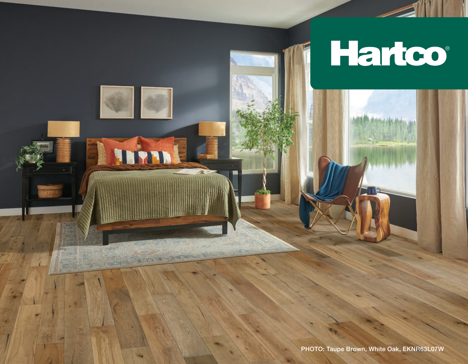
PHOTO: Taupe Brown, White Oak, EKNR63L07W