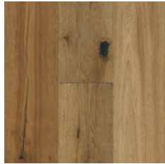
Taupe Brown 6-1/2" EKNR63L07W